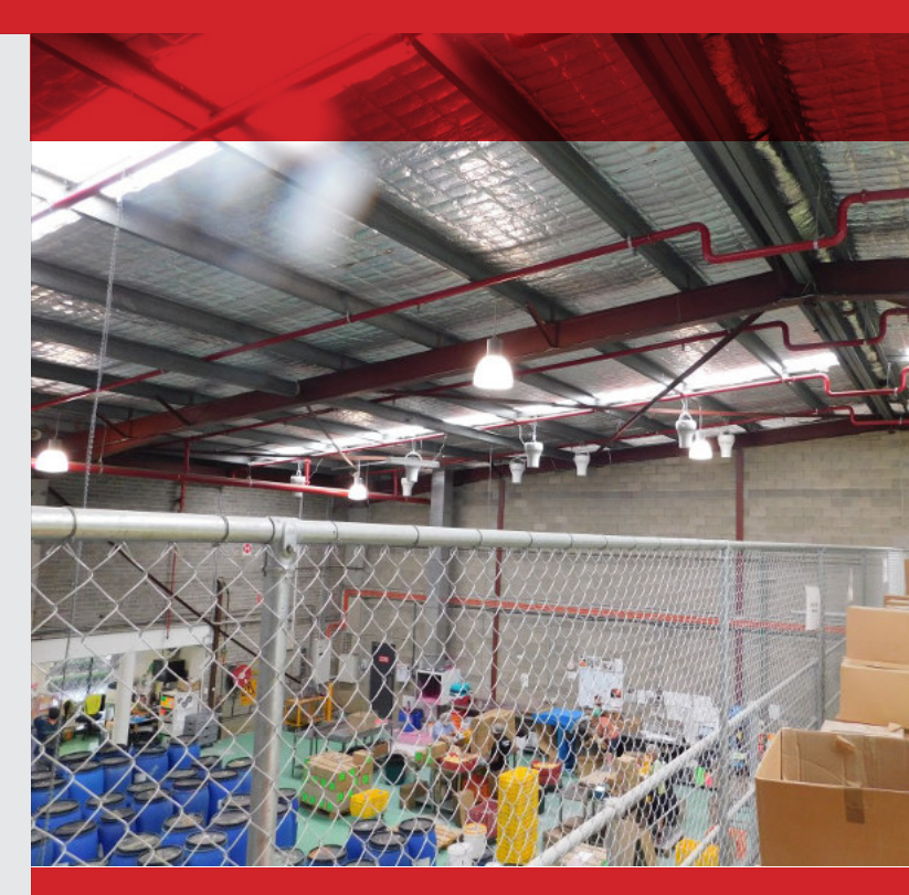
Airius - The World Standard For Destratification www.airius.co.uk

The larger Model 45/PS-2 units were installed at a range of 7-10 metres high.